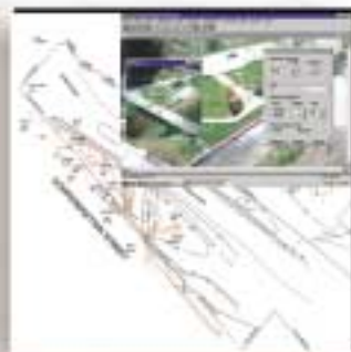
Site Survey From Blimp