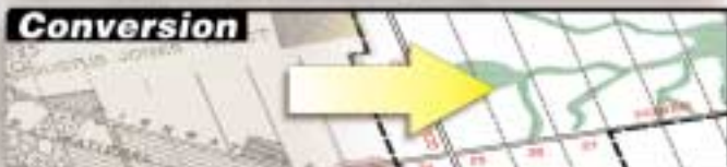
Scanning - Archival - Retrieval - Conversion