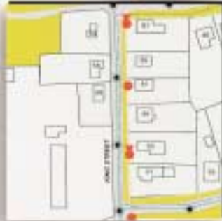
Maps from scratch or Using Existing Info